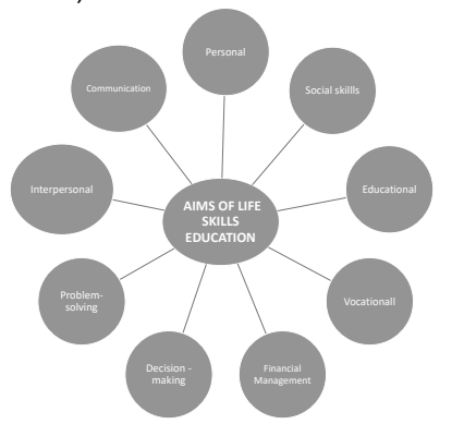
Figure 1: Various skills under Life skills education programmes

Life skills, as a subject, is a way of making meaning out of life; hence the basic aims are to focus on the optimal and holistic development of all learners. It is therefore based on the concept of a holistic education that focuses on personal, social, vocational and educational domains of life. The life skills subject activities in the classrooms are meant for the development of the whole learner and not just for intellectual development alone (Ministry of Education, 2006). Life skills subjects are aimed at teaching learners about health care (including HIV&AIDS), society and family life, self-awareness, personal responsibilities, problem-solving, decision making, positive attitudes, personal values, assertive behaviours, motivation strategies, study skills, examination preparation, time management, and steps in career planning, that subsequently enhance the attaining of the educational goals (Ministry of Education and Culture, National Institute for Educational Development, 1996).