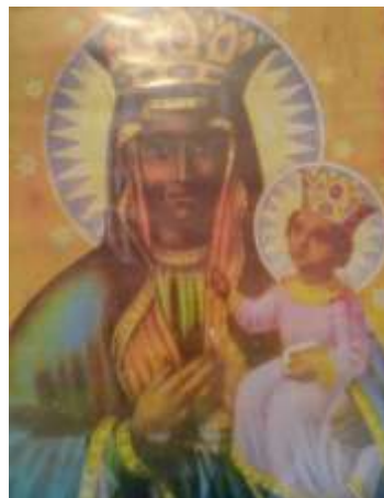
Figure 5. Vodou community (left) in Camp Perrin and an image of Ezili (right) one of the most popular female Iwa. 4 March 2018.