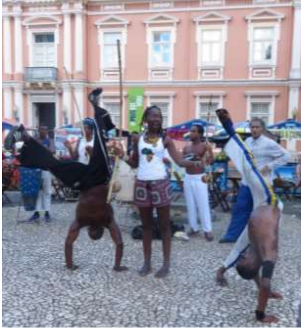
Figure 2. Preserved Africa materials and Capoeira dances in the streets of Salvador de Bahia. 21 December 2016.