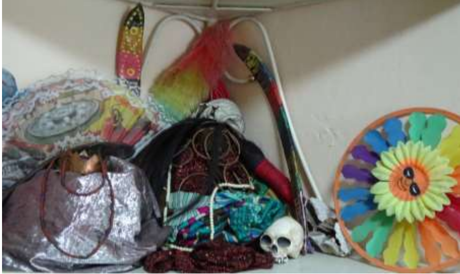
Figure 3. Santería altar in a house in Havana, Cuba. 14 February 2018.

the complex yet enriching history of Santería religion to be young provided that African descendants could only freely practice their culture and religion after the Cuban Revolution.