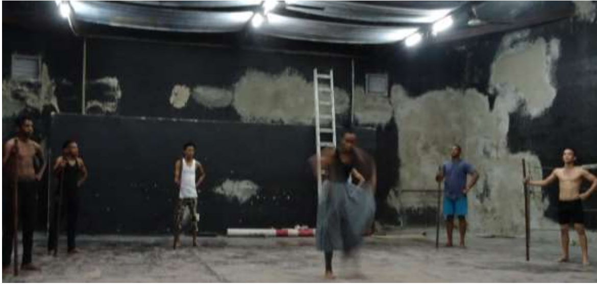
Figure 4. Students performing a ritual dance to Yemayá . 26 February 2018.