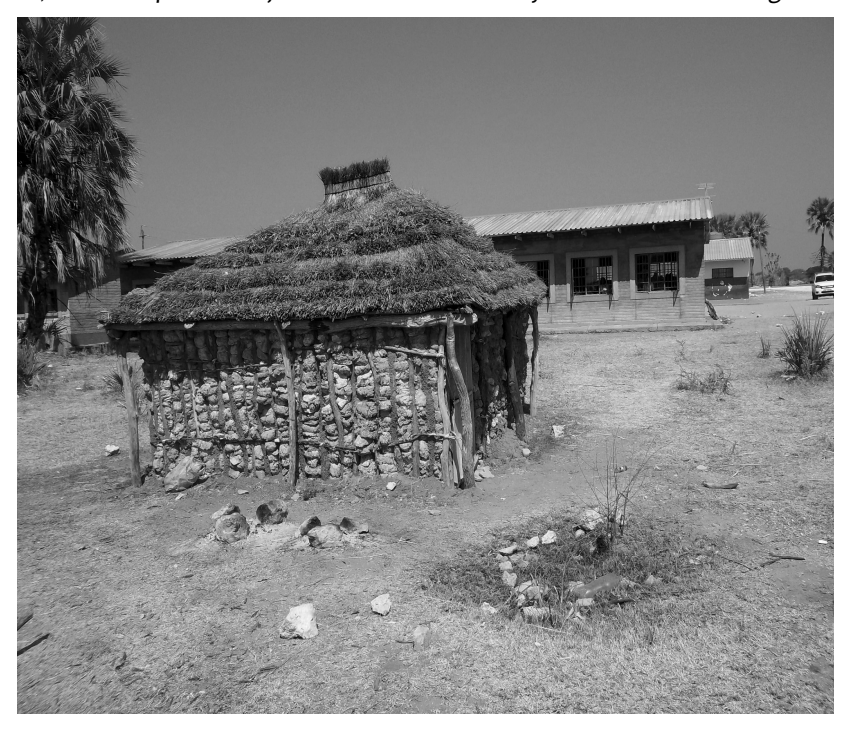
Figure 3: This is another type of community built hostel for a group of boys or girls with a fire place beside it that serves as a communal kitchen for learners (boys and girls).

These types of community built-hostels are common in the region, and when a learner's homestead is located far away from the school, the learner has to sacrifice the comfort of a good home by staying in such places in order to get an education. Female learners reported that in these community hostels they experienced