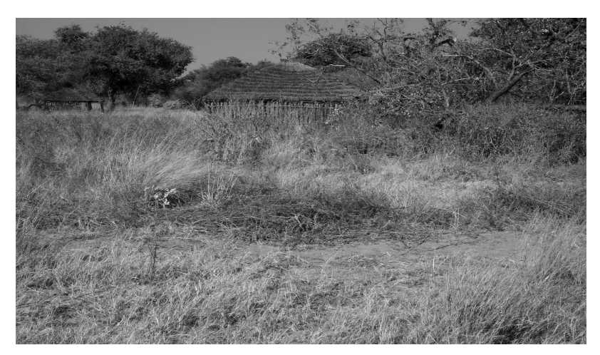
Figure 2: The hut on the far left is the boys' hostel and the one on the right is the girls' hostel, with no provision for a matron or security.