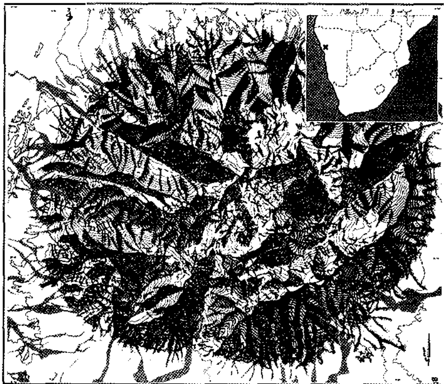
Figure 1: Location of the Dome Gorge in the Dâureb (After Lenssen-Erz & Gwasira 2010:216; Fig 1)