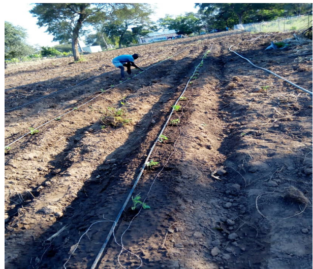
(b) Transplanting of tomato seedlings