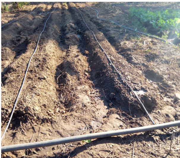
(a) Laying of drippers before transplanting

During land preparations, conventional ploughing was adopted using a tractor drawn plough followed by disc harrowing to achieve a fine tilth. Three planting ridges that were 1.5 m apart were made per plot and drippers were laid on top of each ridge (Figure 3a). A space of 1.5 m was maintained between plots in order to reduce the effects of pesticide drift between the treatments. The tomato variety used in the study was Domino (Zambia Seed Company Limited, Lusaka, Zambia). Three weeks old seedlings were planted in the first week of July, 2017 in each of the ridges at 0.6 m spacing between plants and each plot had 24 plants with a total of 360 seedlings. The seedlings were transplanted in the afternoon to avoid sunburn and this was followed by drip irrigation (Figure 3b). Trellising of tomatoes was done at three weeks after planting.