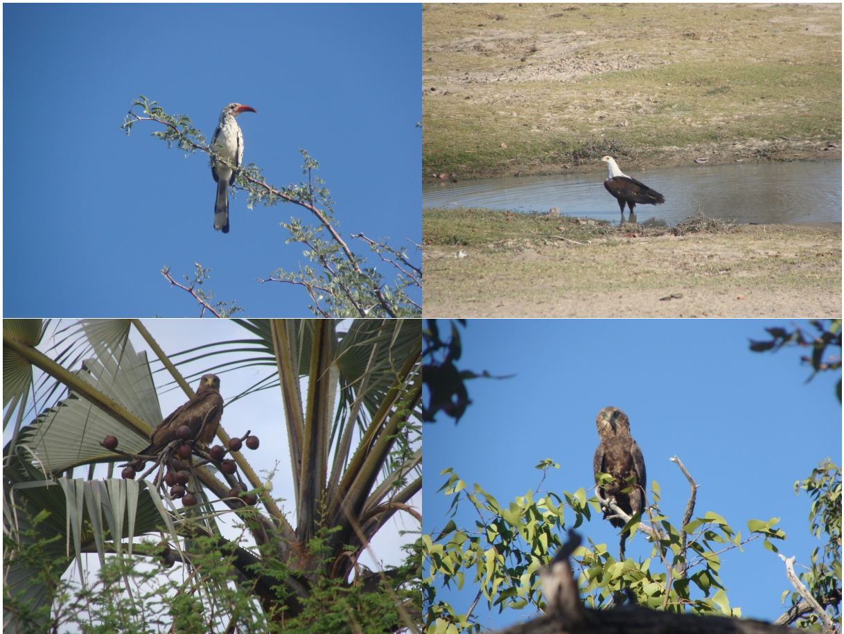
Figure 4: Top left: Red-billed Hornbill; Top-right: African Fish Eagle preying upon catfish; Bottom-left: Yellow-billed Kite roosting in a palm tree; Bottom-right: Juvenile Bateleur.