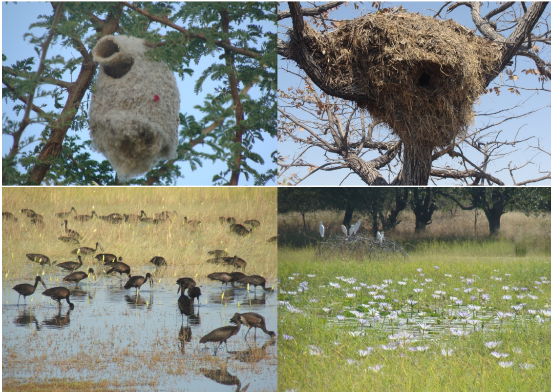
Figure 5: Top left: . A nest of the Cape Penduline-Tit; Top-right: A Hammerkop nest usurped by the Barn Owl; Bottom-left: A flock of the African Openbill Stork foraging on snails; Bottom-right: Small oshana with Cattle Egrets in the background.