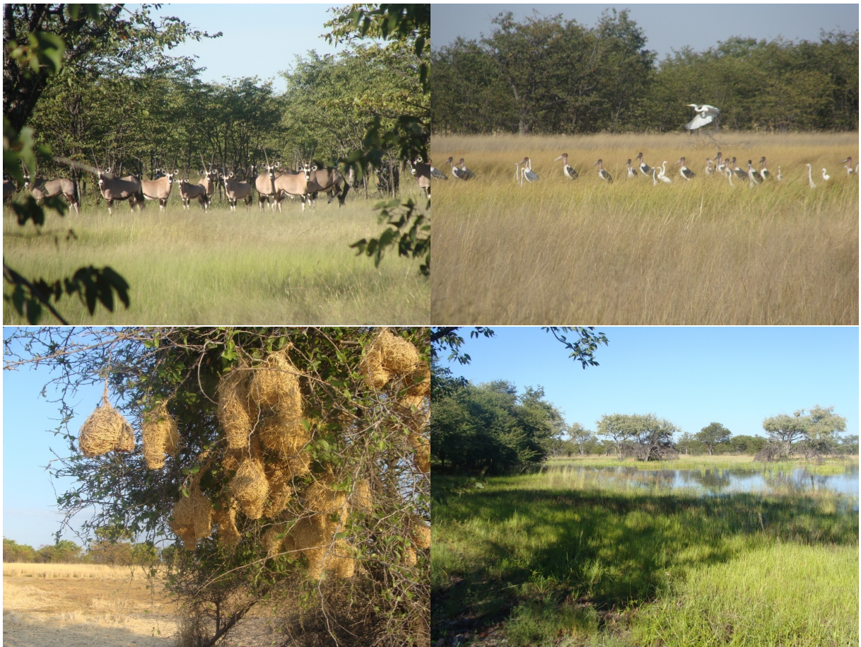
Figure 2: Top left: Young stage of mopane savanna, which is predominant in the Ogongo Game Reserve; Top-right: A mixed flock of the Marabou Storks and Great Egrets; Bottom-left: A breeding colony of the Southern Masked Weaver; Bottom-right: Larger oshana surrounded by mature trees.

The UNAM Ogongo Game Reserve has been established in 1997. Its surface area is c. 1000 ha. The vegetation comprises mainly the Mopane Savanna Colophospermum-Acacia nilotica . Tree species diversity is relatively low (Shannon Diversity Index = 1.15) because of a strong domination of the Mopane Colophospermum mopane (69.8%) and Acacia nilotica (14.8%). Other common tree species include Combretum collinum (8.2%), Terminalia sericea (2.1%), Comiphora africana (1.8%), Acacia siberiana (1.5%) and Acacia flecki (0.6%). The stand density was estimated at c. 50 trees per ha. Most trees in the reserve are small, with a mean diameter 14.8 cm and mean height 7 m. Most trees (60%) are less than 10 cm in diameter (Ndeinoma, 2009). The most common grass species for grazing are Schmidtia kalahariensis , Cynodon dactylon , Brachiria spp., Digitaria spp., Antheophora spp., Eragrostis spp., Enneapogon spp. and Panicum spp (Fig. 2). The eastern part of the reserve comprises a large oshana mainly with Eragrostis grasses. It retains rain water for almost whole year (Ndeinoma, 2009).