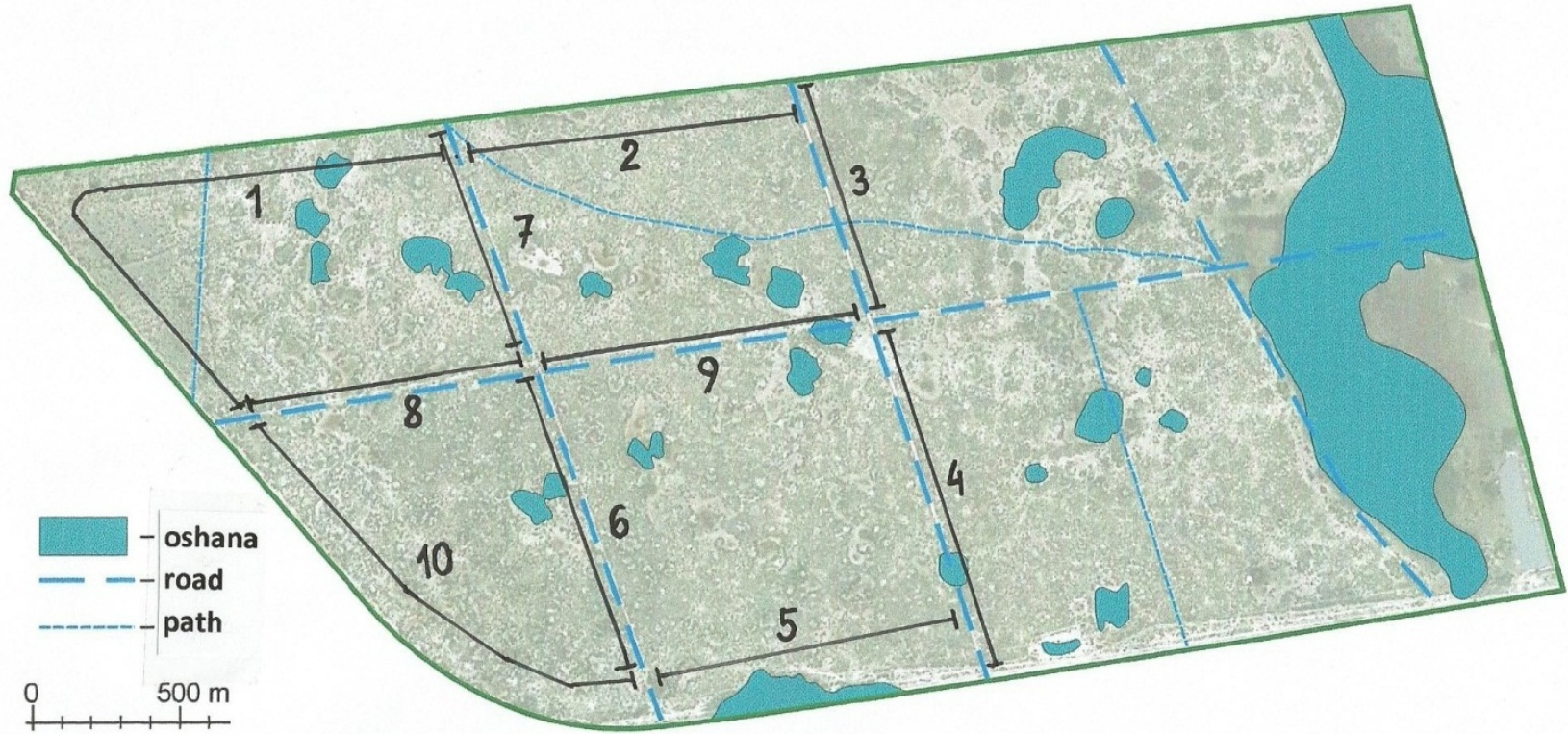
Figure 1: Map of Ogongo Game Reserve showing distribution of transects (1-10).